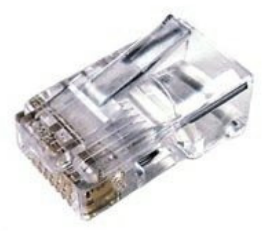
CAT6 RJ-45 Connector for stranded wire

You have to look closely to see the difference between these two connector type examples. Terminating a category cable with the wrong modular connector can lead to intermittent problems with the cable channel. Keep connector stock well labeled and separated.